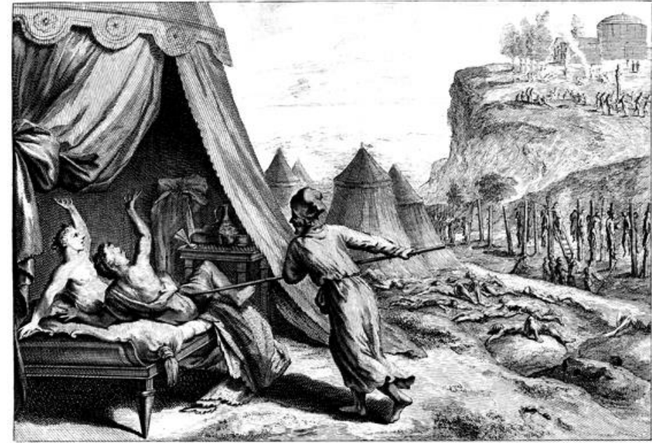
Slaying of Zimri and Cozbi (Moab)