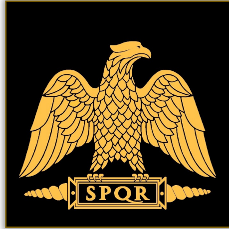
(26 YEARS) AD 70 ROMAN INVASION (ACT 2:16-20)