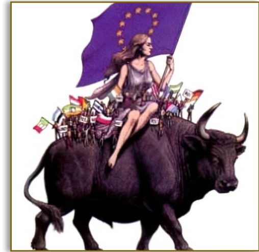
GOGIAN INVASION JESUS' RETURN (JOEL 2:32)