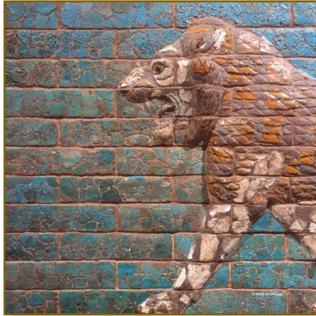
NIGH AT HAND (17 YEARS) 587 BC BABYLONIAN INVASION (JOEL 2:1)